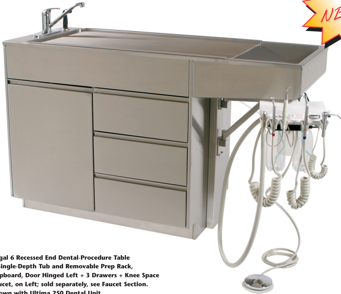
Regal 6 Recessed End Dental-Procedure Table 6 Single-Depth Tub and Removable Prep Rack, Cupboard, Door Hinged Left + 3 Drawers + Knee Space Faucet, on Left; sold separately, see Faucet Section. Shown with Ultima 250 Dental Unit.

*Low/High Speed and Scaler handpieces are customer supplied.