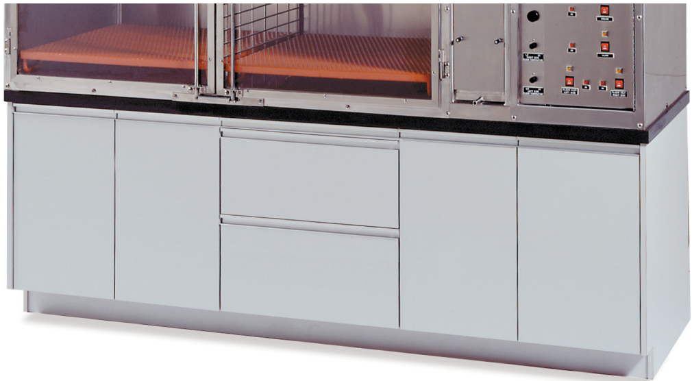
Imperial/Regal Modular Cabinetry Base for Intensive Care Unit