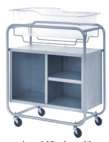
Imperial Bassinet with 3 Compartment Storage Cabinet