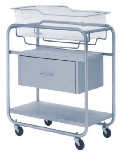
Imperial Bassinet with Shelf and Side Opening Drawer