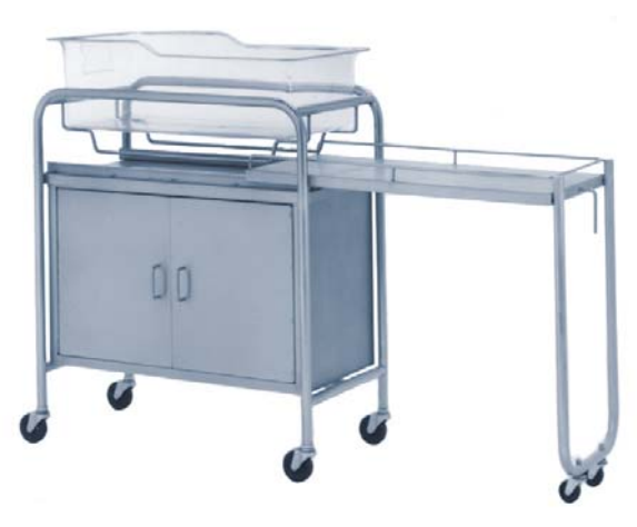
Classic Stainless Steel Bassinet with Cross Brace Slide-Out Shelf with 3-sided Retaining Rail & 2 Door Cabinet