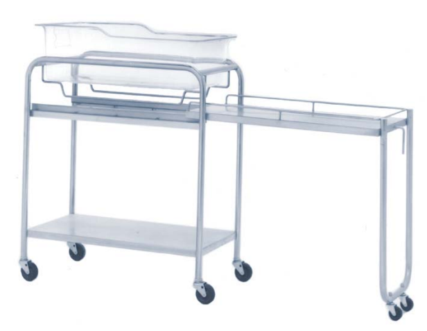
Classic Bassinet with Shelf Slide-Out Shelf with 3-sided Retaining Rail