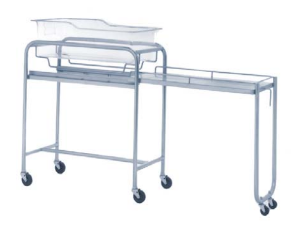
Classic Bassinet with Cross Brace Slide-Out Shelf with 3-sided Retaining Rail