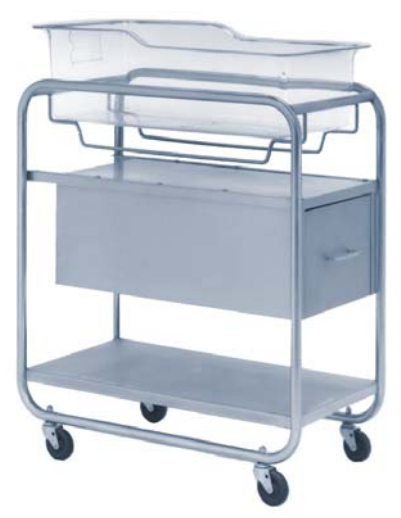
Imperial Bassinet with Shelf and End Opening Drawer

Imperial Bassinets with the Slide-Out Shelf extends to a positive stop preventing accidental removal.