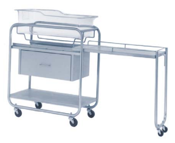
Imperial Bassinet with Shelf Slide-Out Shelf with 3-sided Retaining Rail & Side Opening Drawer