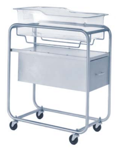
Imperial Bassinet with End Opening Drawer