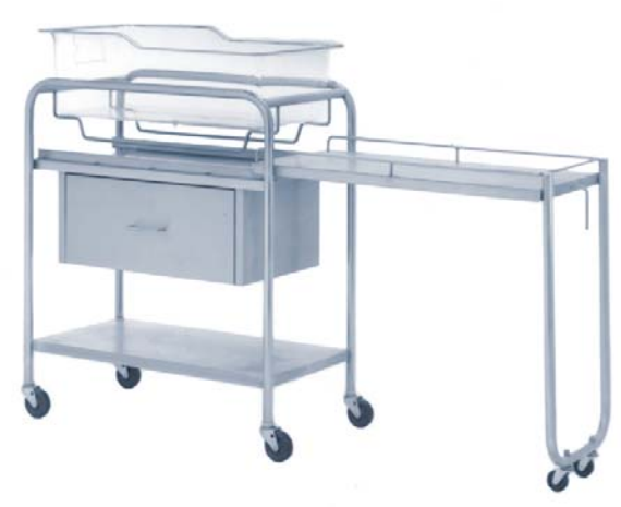
Classic Bassinet with Shelf Slide-Out Shelf with 3-sided Retaining Rail & Side Opening Drawer