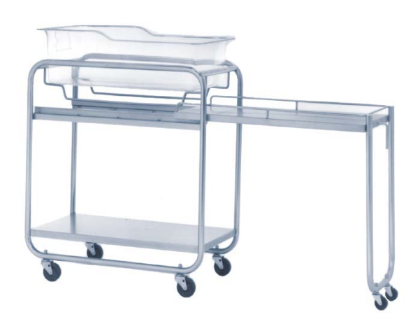
Imperial Bassinet with Shelf Slide-Out Shelf with 3-sided Retaining Rail