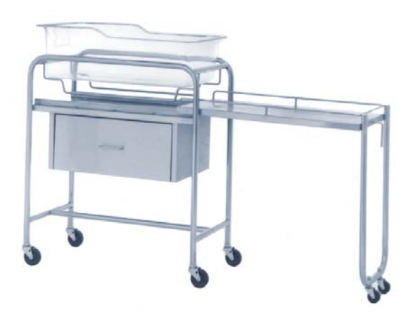
Classic Bassinet with Cross Brace Slide-Out Shelf with 3-sided Retaining Rail & Side Opening Drawer