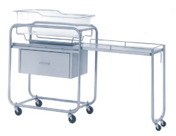
Imperial Bassinet, Slide-Out Shelf with 3-Sided Retaining Rail & Side Opening Drawer