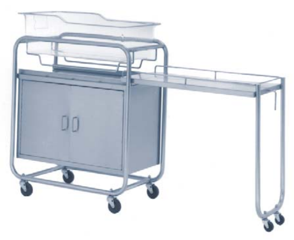
Imperial Stainless Steel Bassinet with Slide-Out Shelf with 3-sided Retaining Rail & 2 Door Cabinet