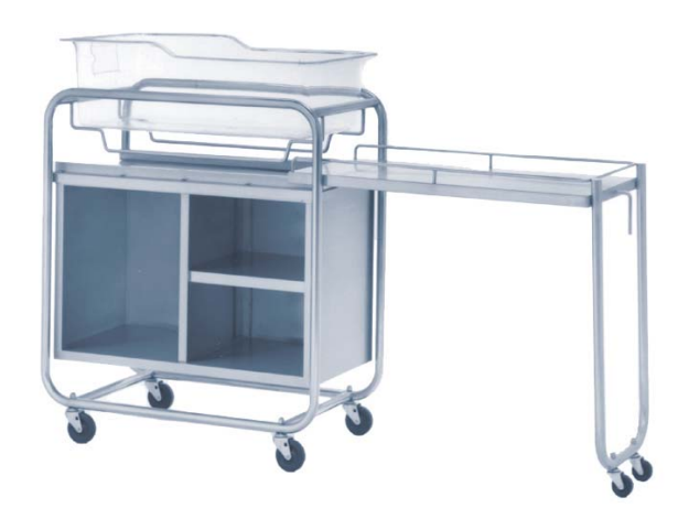
Imperial Stainless Steel Bassinet with Slide-Out Shelf with 3-sided Retaining Rail & 3 Compartment Storage Cabinet