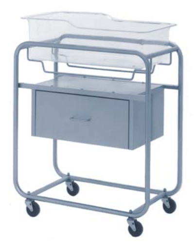
Imperial Bassinet with Side Opening Drawer