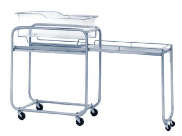
Imperial Bassinet Slide-Out Shelf with 3-sided Retaining Rail

Imperial Bassinets with the Slide-Out Shelf extends to a positive stop preventing accidental removal.