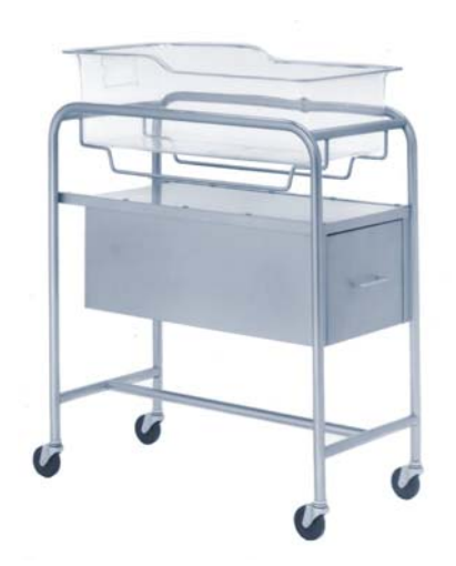
Classic Bassinet with Cross Brace and End Opening Drawer