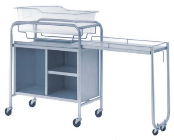
Classic Stainless Steel Bassinet with Cross Brace Slide-Out Shelf with 3-sided Retaining Rail & 3 Compartment Storage Cabinet