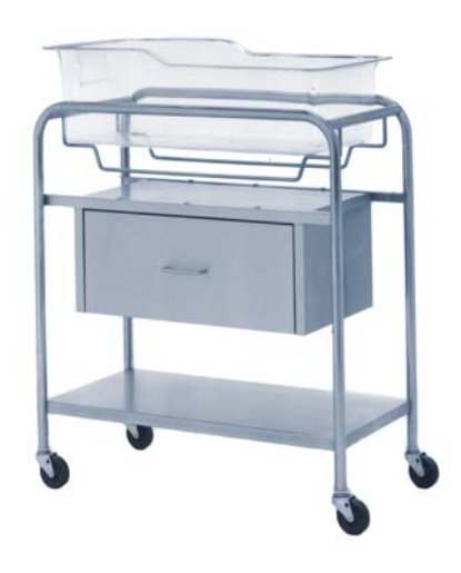
Classic Bassinet with Shelf and Side Opening Drawer