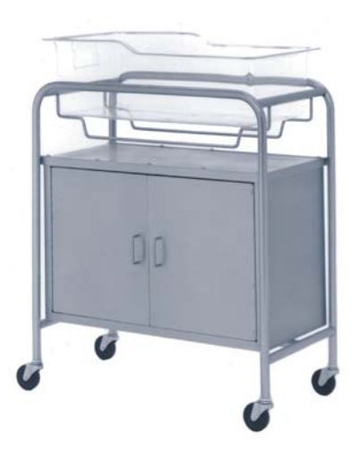
Classic Bassinet with Cross Brace and 2 Door Cabinet