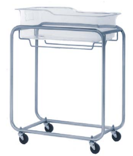
Imperial Bassinet with Cross Brace

The Chassis is made from 16 gauge, 1" tubular stainless steel, type 304 and has 3" diameter casters with non-marking wheels with swivel. The Basket is .375" diameter rod stainless steel, type 304, and everything has a bright buffed finish.