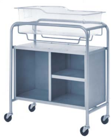
Classic Bassinet with Cross Brace and 3 Compartment Storage Cabinet