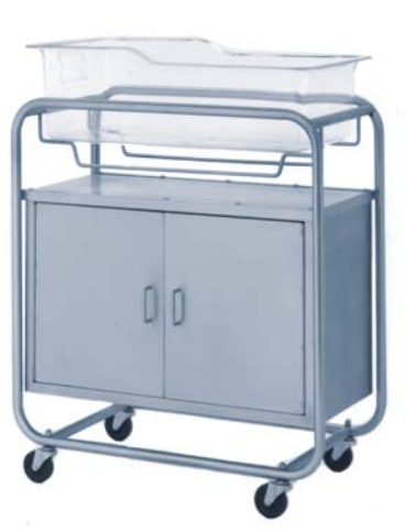
Imperial Bassinet with 2 Door Cabinet