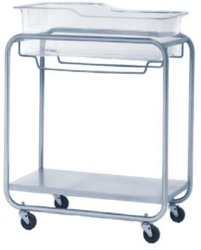
Imperial Bassinet with Shelf