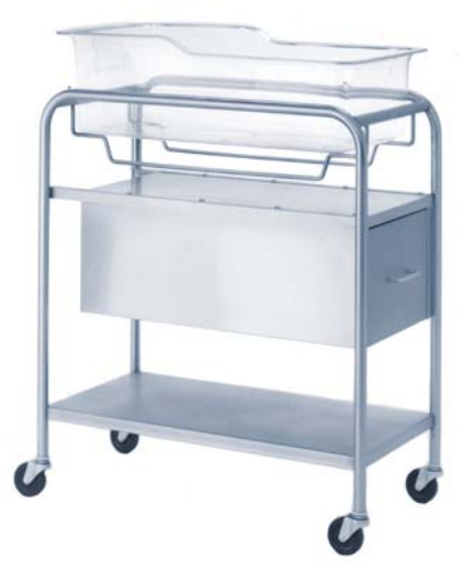
Classic Bassinet with Shelf and End Opening Drawer