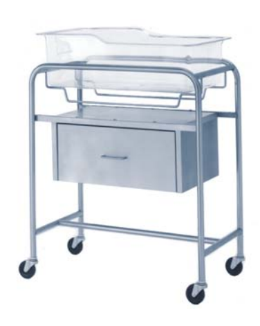
Classic Bassinet with Cross Brace and Side Opening Drawer