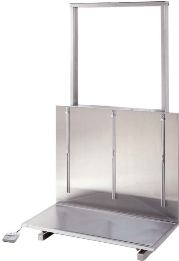
Elite Floor-standing Lateral Lift Table