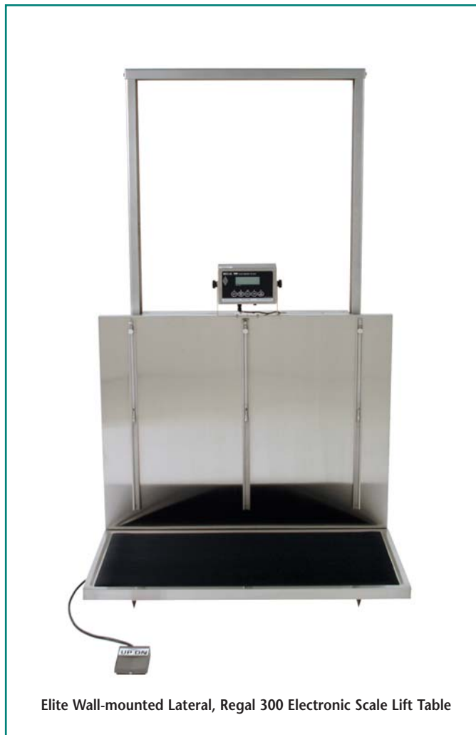
Elite Wall-mounted Lateral, Regal 300 Electronic Scale Lift Table