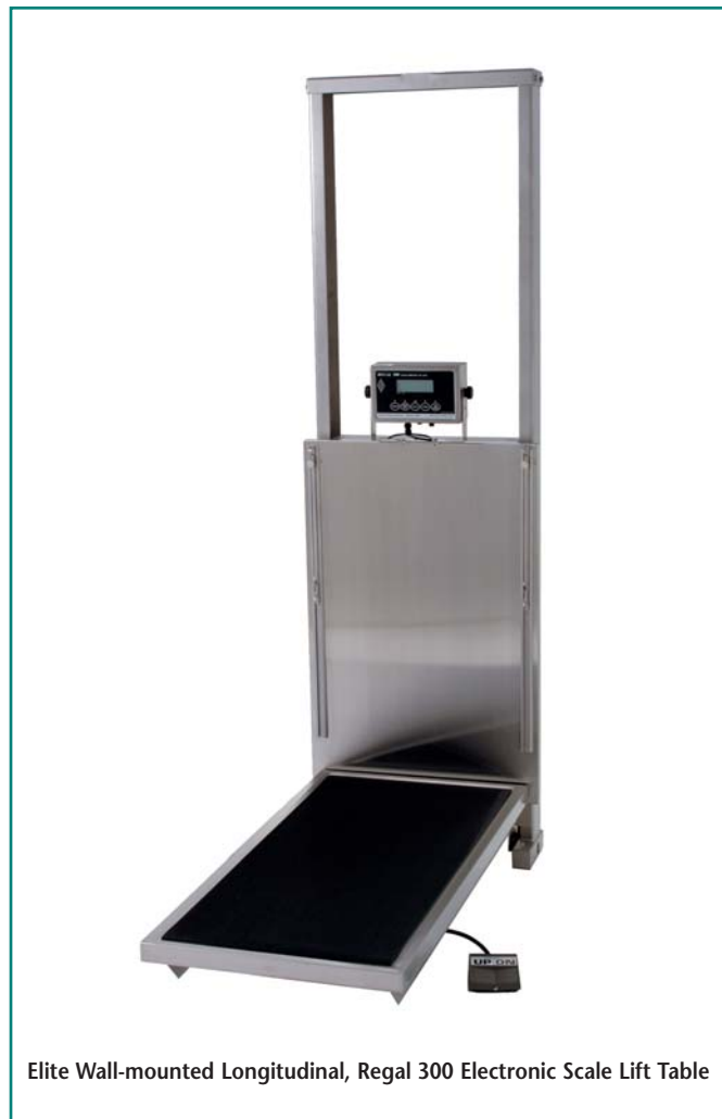
Elite Wall-mounted Longitudinal, Regal 300 Electronic Scale Lift Table