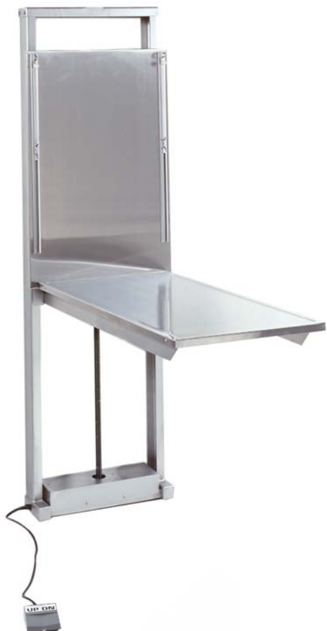
Elite Wall-mounted Longitudinal Lift Table