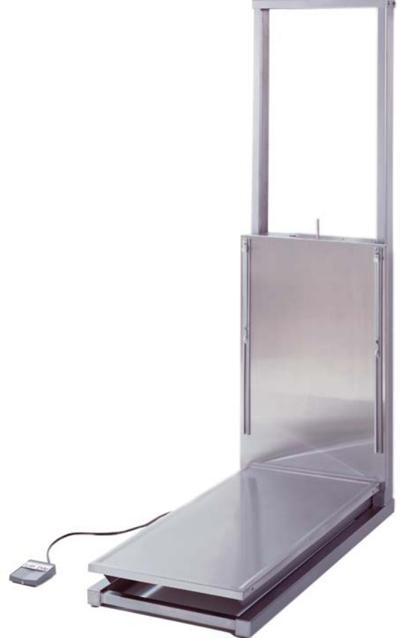
Elite Floor-standing Longitudinal Lift Table