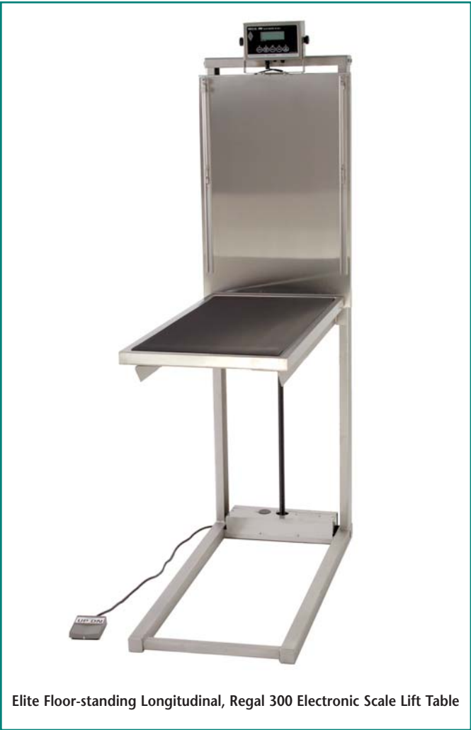
Elite Floor-standing Longitudinal, Regal 300 Electronic Scale Lift Table