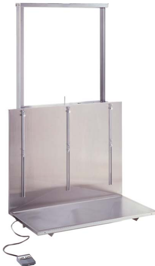
Elite Wall-mounted Lateral Lift Table