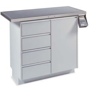
Elite Floor-standing Lateral and Longitudinal Lift Tables Elite Wall-Mount Lift Tables are also available.

Regal Wall-Mount Lateral and Longitudinal Lift Tables Regal Floor-standing Lift Tables are also available.