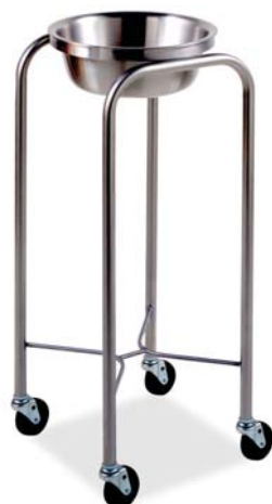
Mobile Solution Stand with One Basin and Cross Brace