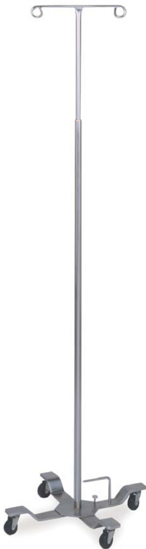
Mobile IV Stand

Whether you're looking for Mayo Stands, IV Stands, Solution Stands or Sponge Receptacles, you'll find it at SSCI.