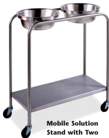
Mobile Solution Stand with Two Basins and Shelf