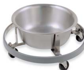
Mobile Sponge Receptacle with Round Basin