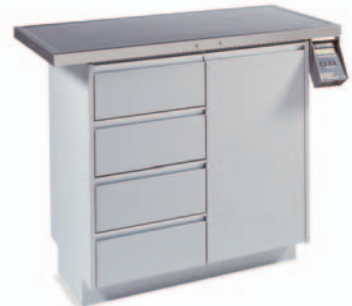
Premier Exam Table