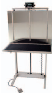
Elite Floor-standing Lateral and Longitudinal Lift Tables Elite Wall-Mount Lift Tables are also available.