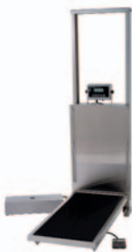
Regal Wall-Mount Lateral and Longitudinal Lift Tables Regal Floor-standing Lift Tables are also available.