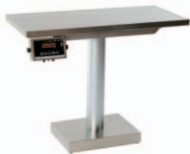
Pedestal Exam/ Treatment Table

The Regal 300 Scale is truly portable while operating with its' built-in 6-v. rechargeable battery or it can continuously powered by leaving the battery's charger plugged in.