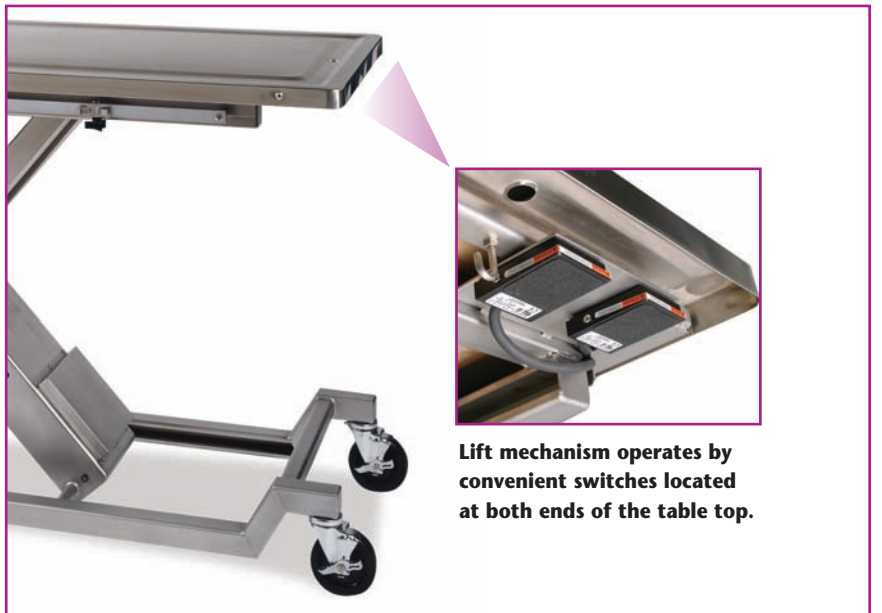
Lift mechanism operates by convenient switches located at both ends of the table top.