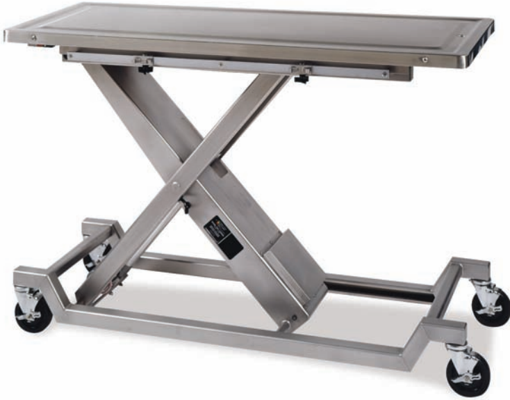
Regal Vet-Mate Lift-Gurney

SSCI OFFERS SEVERAL STYLES OF GURNEYS DESIGNED TO MEET ALL OF YOUR FACILITY'S NEEDS: