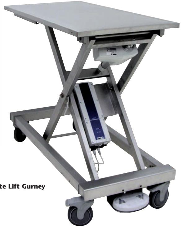
Classic Vet-Mate Lift-Gurney