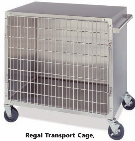
Regal Transport Cage, see Section 1