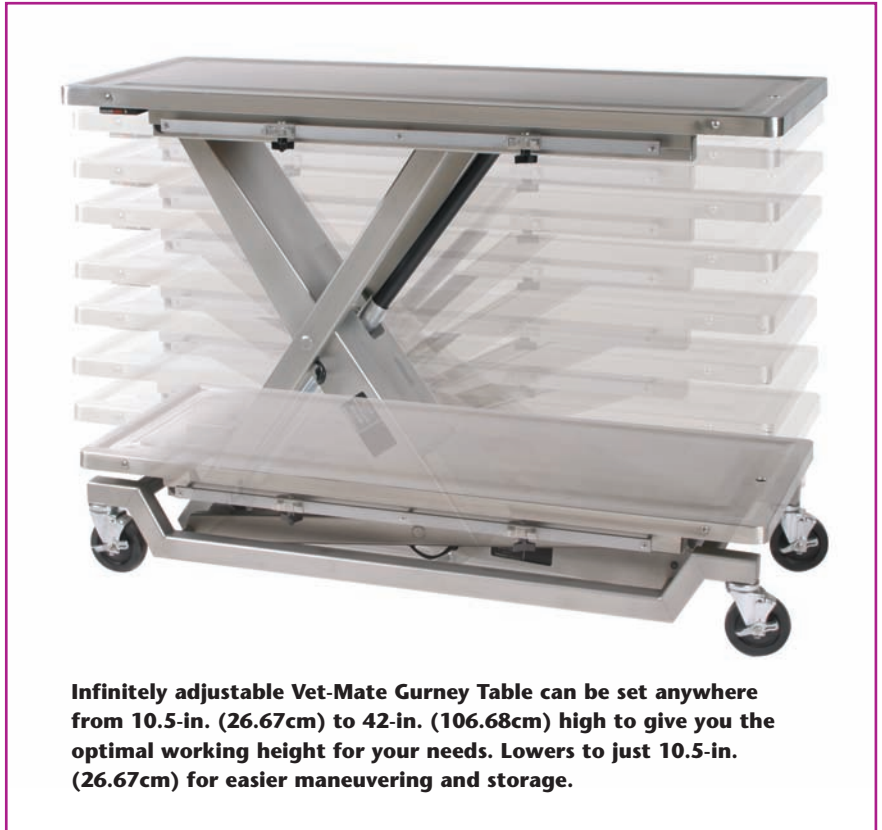
Infinitely adjustable Vet-Mate Gurney Table can be set anywhere from 10.5-in. (26.67cm) to 42-in. (106.68cm) high to give you the optimal working height for your needs. Lowers to just 10.5-in. (26.67cm) for easier maneuvering and storage.

Heavy-gauge tubular stainless steel construction stands up to rugged daily use. All joints are heli-arc welded for superior strength.