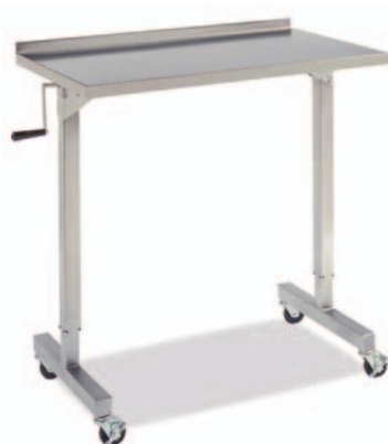
Over Instrument Table