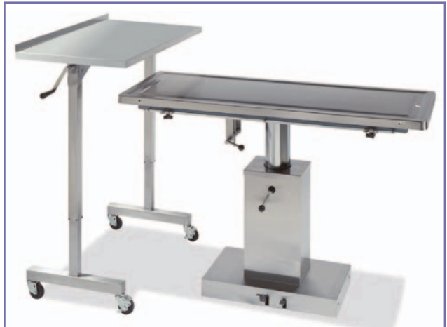
Over Instrument Table can be raised and lowered to adjust to the height of your operating table.

Use this Table to keep surgical instruments, supplies, even monitoring equipment conveniently close at hand during procedures. Manufactured entirely of durable Type 304 stainless steel, our Over Instrument Table features a mobile telescoping base for versatility. Plus, our conveniently-designed crank operates from either side of the Table to raise top height from 39-in. to 62-in. (99.06cm to 157.48cm). Table top surface measures a full 40-in. long x 23-in. wide (101.60cm long x 58.42cm wide) to hold an assortment of supplies. And the raised back rail keeps equipment from sliding off accidentally. Rolls smoothly on 3-in. (7.62cm) diameter non-marking casters to allow you to move Table into position easily. Two casters have brakes for safety.