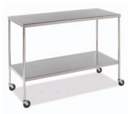
Instrument Table with Shelf