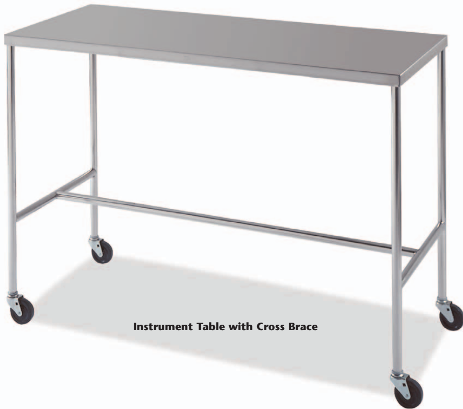
Instrument Table with Cross Brace

Whether you're looking for Instrument Tables, Over Instrument Tables or Utility Tables, you'll find it at SSCI.