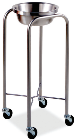
Mobile Solution Stand with One Basin and Cross Brace