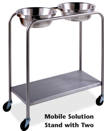
Mobile Solution Stand with Two Basins and Shelf