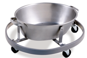
Mobile Sponge Receptacle with Oval Basin