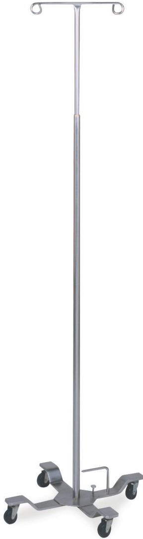
Mobile IV Stand

Whether you're looking for Mayo Stands, IV Stands, Solution Stands or Sponge Receptacles, you'll find it at SSCI.