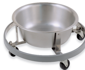
Mobile Sponge Receptacle with Round Basin